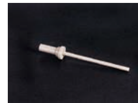
PEEK 9Φ×65mm (tip: 2.5Φ)