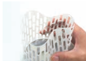
PVC 100Φ×150mm t=100μm