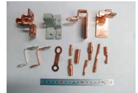
Plank busbar for automotive