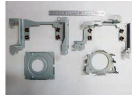
Bracket for Automotive